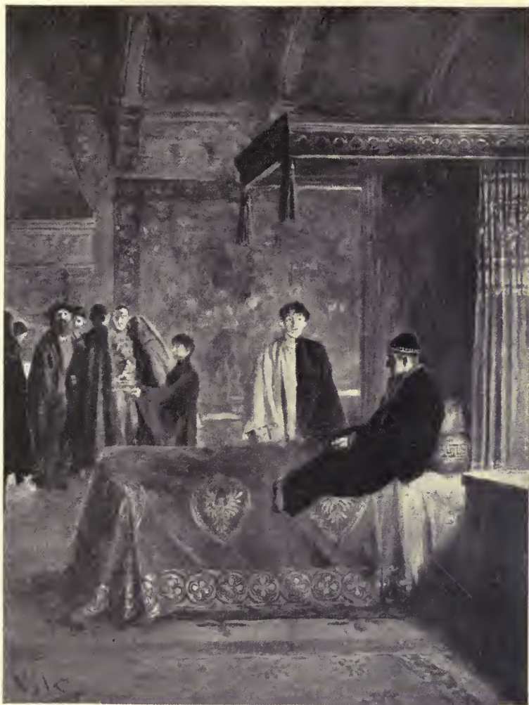
"Myles found himself standing beside the bed"